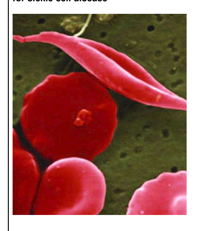
U.S. FDA approves pair of gene therapies for sickle cell disease