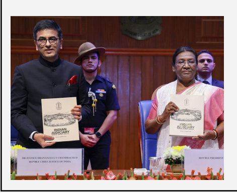
President Murmu calls for all-India judicial service