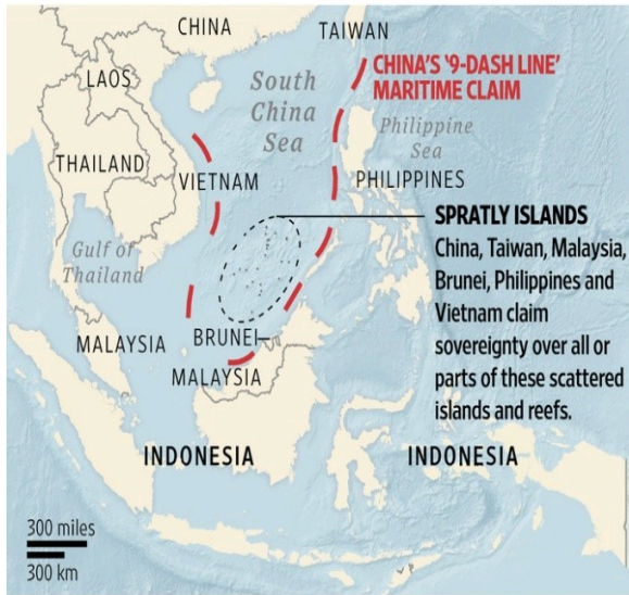
THE WALL STREET JOURNAL.