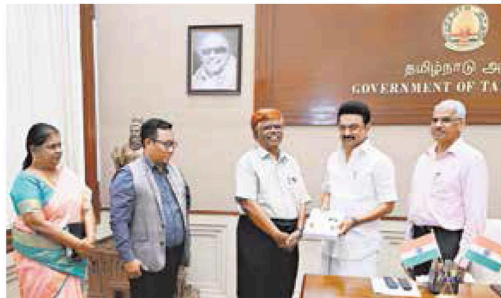
Justice K. Chandru submitting the one-man panel's report to Chief Minister M.K. Stalin at the Secretariat.

The Justice K Chandru Committee, formed after the mysterious death of a 17-year old inmate of the Government Observation Home in Chengalpattu in December 2022, has given various recommendations to the government with respect to administration of homes for children in conflict with law (CCL). Here are a few of them: