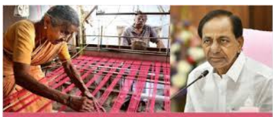
Telangana Chenetha Mitra Scheme