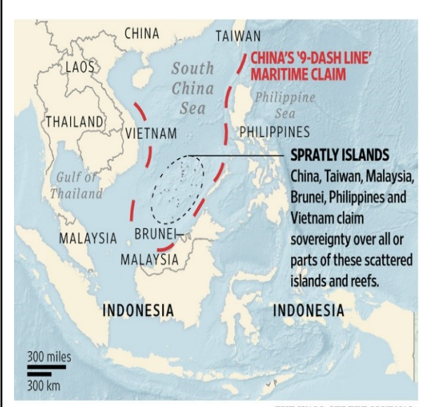
THE WALL STREET JOURNAL.