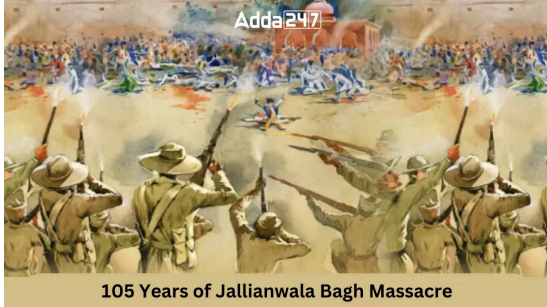
105 Years of Jallianwala Bagh Massacre