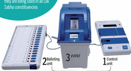
1 & 2 are joined by a cable. Taken together, the system is called EVM

VVPATs were used in eight constituencies during the 2014 general election as a pilot project. This is the first time they are being used in all Lok Sabha constituencies